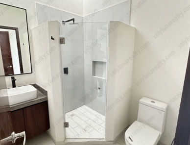
Toda la información en el documento es de fuentes confiables. Sol y Luna Real Estate recomienda verificarla. Sujeta a cambios sin pevio aviso. All information in this document is reliable. Sol y Luna Real Estate recommends verification. Changes without notice